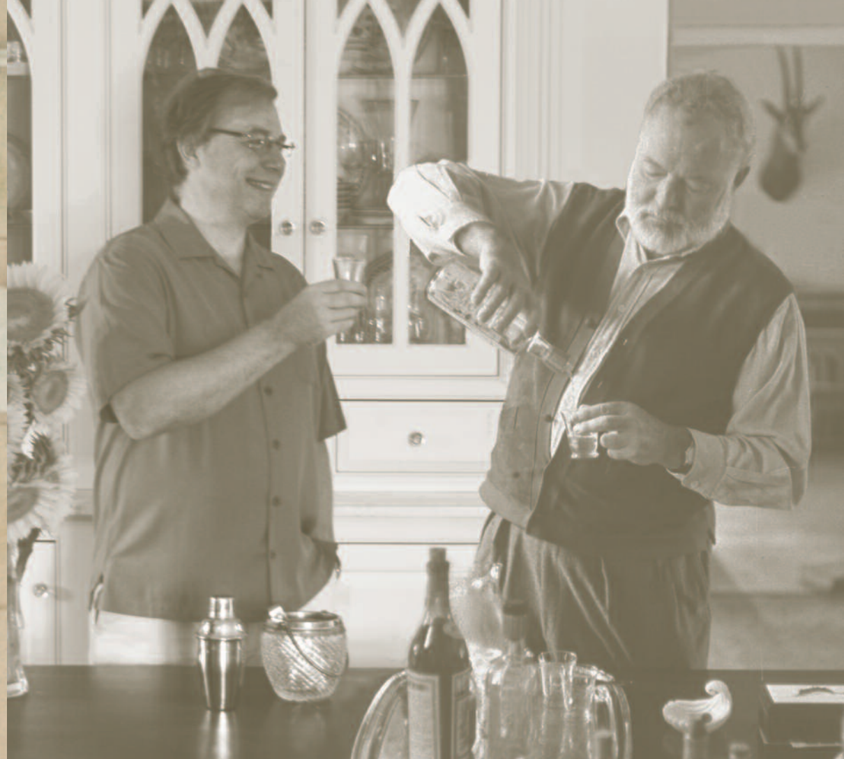
Photo of Ernest Hemingway