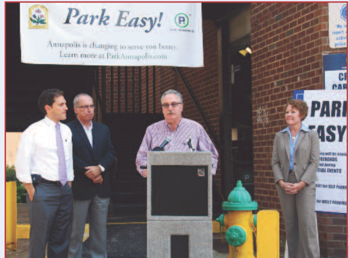
Park Easy Kick-off