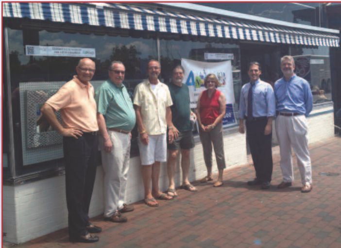
Art in the Storefronts